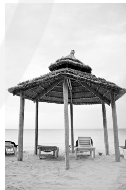
A beach bungalow