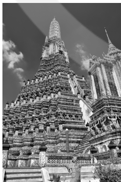
Bangkok - Wat Arun