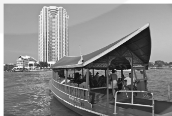
A river taxi