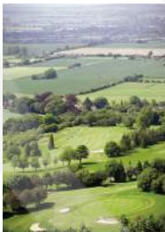
...the golf courses in Hawaii? ...fantastic.

9. Masahiro went to Hawaii to play golf. He loved the golf courses there.