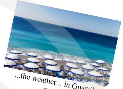
...the weather... in Guam? ...perfect.