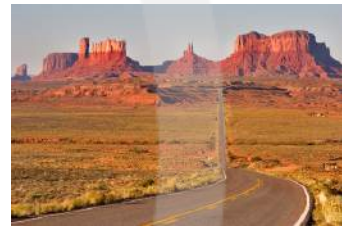
...Monument Valley... in the U.S.? ...gorgeous.