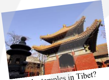
...the temples in Tibet? ...very interesting.