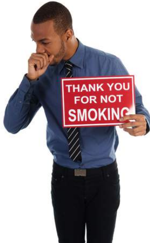
His coworkers (smoke) a lot.