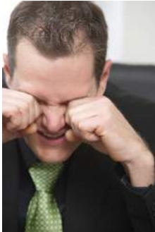
He (uses) the computer too much.