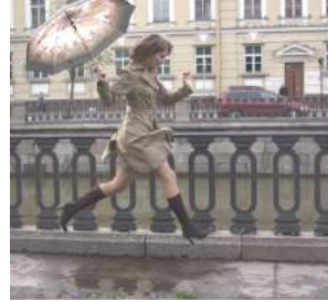
It (rains) a lot.