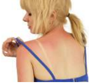
She (goes) to the beach a lot.