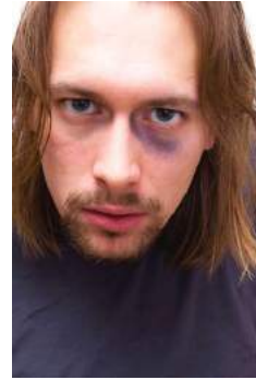
He (fights) again.