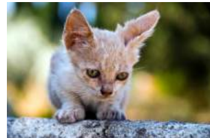
He (doesn't eat) well.