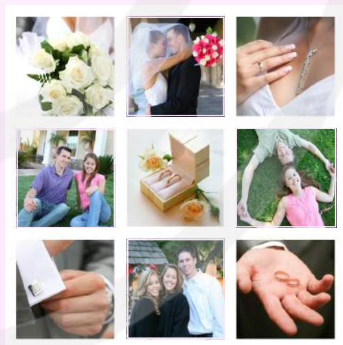
These are memories...