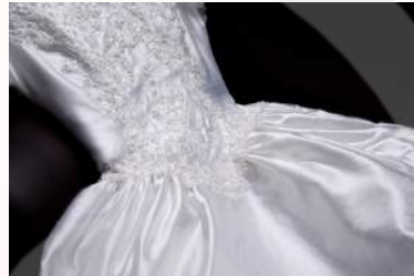
Chieko wore a white wedding dress...