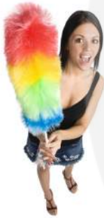
1. (Amy) dusted the house.

Bill was the one that took out the garbage. ごみを出したのはBillでした。