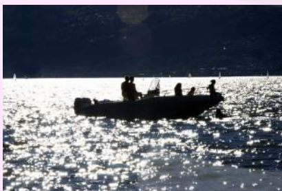
There are boats...