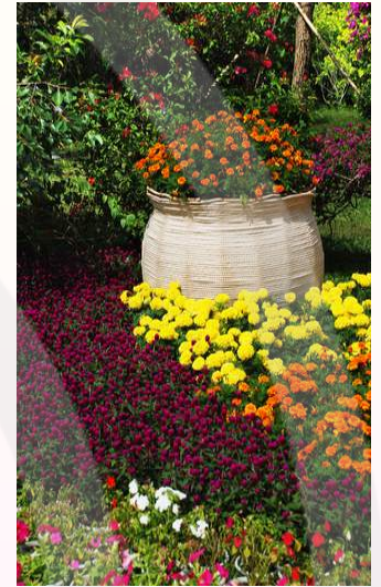
The reception was held outside in a garden...