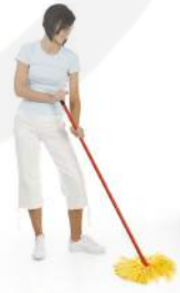
8. (Helen) mopped the floors.