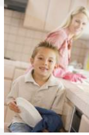
12. (Luke) dried the dishes.