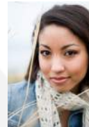
1. Tara - interesting - enjoy being with