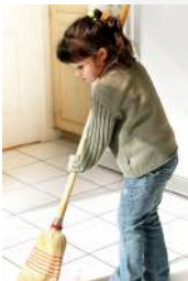
5. (Emily) swept the kitchen floor.