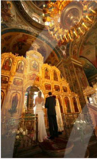
The wedding was held in a church...