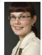
8. Susan - honest - trust