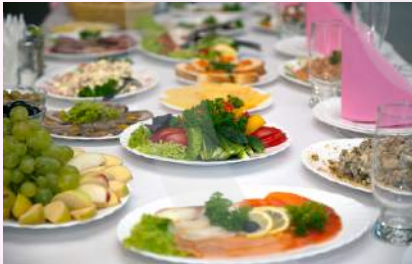
All the tables were filled with delicious food...