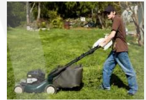
17. (Quincy) mowed the lawn.