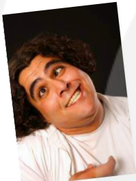
4. ...funn(y)~ TV comedian