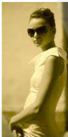
7. ...beautiful actress