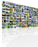
5. ... (bad) TV show