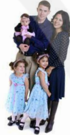
3. ...tall~ person in your family