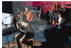
8. ...exciting musician or band