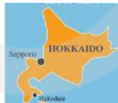
10. ...far~ town in Hokkaido