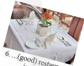
6. ... (good) restaurant in town