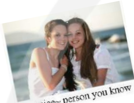
1. ...nice~ person you know

4b. ペアになりましょう。ひとりはこのページを見ながら、“Who is the...” / “What is the...”を使って質問し、パートナーは、前ページに戻ってその質問が正しいかどうかを確認します。1-5, 6-10のように役割を交代して練習しましょう。