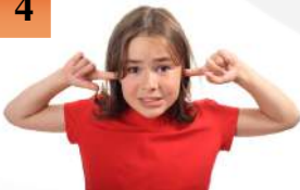
My neighbors are noisy.