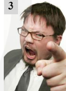
My boss is mean.