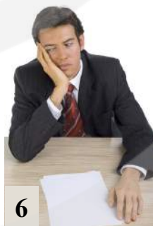
My job is boring.