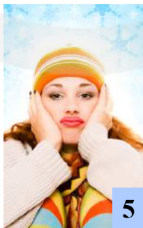
Life is hard.